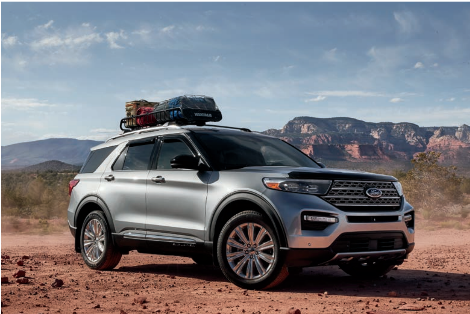
Limited. Iconic Silver Metallic. Available and aftermarket equipment.

Ford Genuine Parts & Service. Keep your vehicle in optimum operating condition with scheduled maintenance service. Ford and Lincoln Dealership technicians know your vehicle inside and out. They are continuously trained by Ford Motor Company and the parts they use are specifically designed for your vehicle. □ See your dealer for limited warranty information on Ford Original Accessories. Ford Licensed Accessories (FLA) are warranted by the accessory manufacturer's warranty. FLA are designed and developed by the accessory manufacturer and have not been designed or tested to Ford Motor Company engineering requirements. Contact your Ford Dealer for details and/or a copy of all limited warranties.