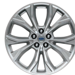
20" PREMIUM PAINTED ALUMINUM Standard

Ebony Leather with Perforated Inserts / 1-9