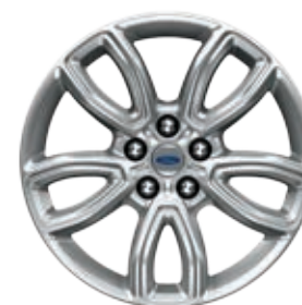
18" PAINTED ALUMINUM Standard