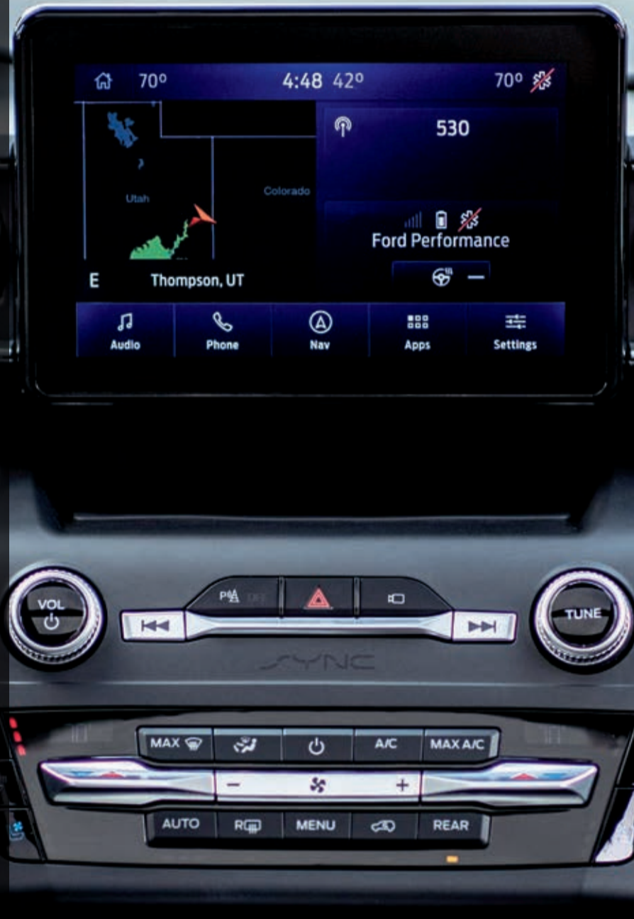
U.S. model shown. Screen display varies by market.

Android Auto and Google are trademarks of Google Inc. Apple CarPlay and Siri are trademarks of Apple Inc., registered in the U.S. and other countries.